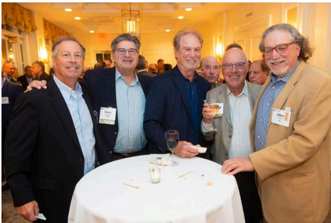
Members socializing during Cocktail Hour at Amity event