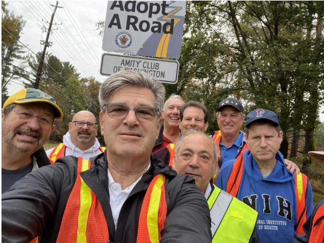
At our Quarterly Road Clean up on Falls Rd. in Potomac, MD