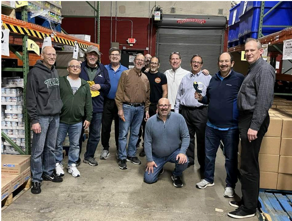
Amity members volunteer at MANNA to help assemble packages for food donation

For further information, including membership, please visit our website: www.amityclubofwashington.org